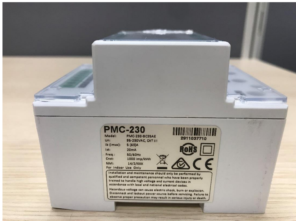
CET Electric Technology Inc. model CET PMC-230-BC35AE Electricity Meter (Markings)